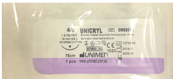
Fig 3: 4.0 UNICRYL - Braided and Coated glycolide homopolymer violet synthetic absorbable suture

Silver nitrate: Indications of use are when sutures or finger pressure aren't suitable and after the mucosal biopsy is taken from hard palate. It is considered a strong substance of cauterization, available in the form of a pencil with a concentration of 95 %. The tip of the pencil is directed towards the area of bleeding and action is seen in a few minutes.