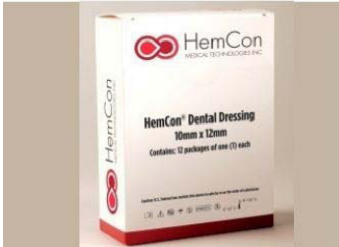
Fig. 1: Hemcon Dental Dressing (HDD).

Ferric sulfate: It has a wide range of uses in the dental clinic such as being a part of gingival retraction technique to impress the work in crown/bridge, during pulpotomy as a haemostatic substance, use as a control measure of after-extraction bleeding not common but it may help in cases with a tear in the mucosa.