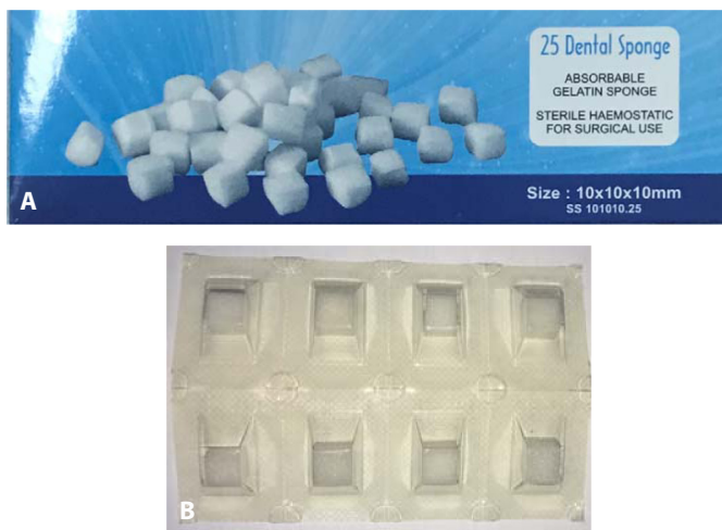
Fig. 2A and 2B: Absorbable Gelatin Sponge.